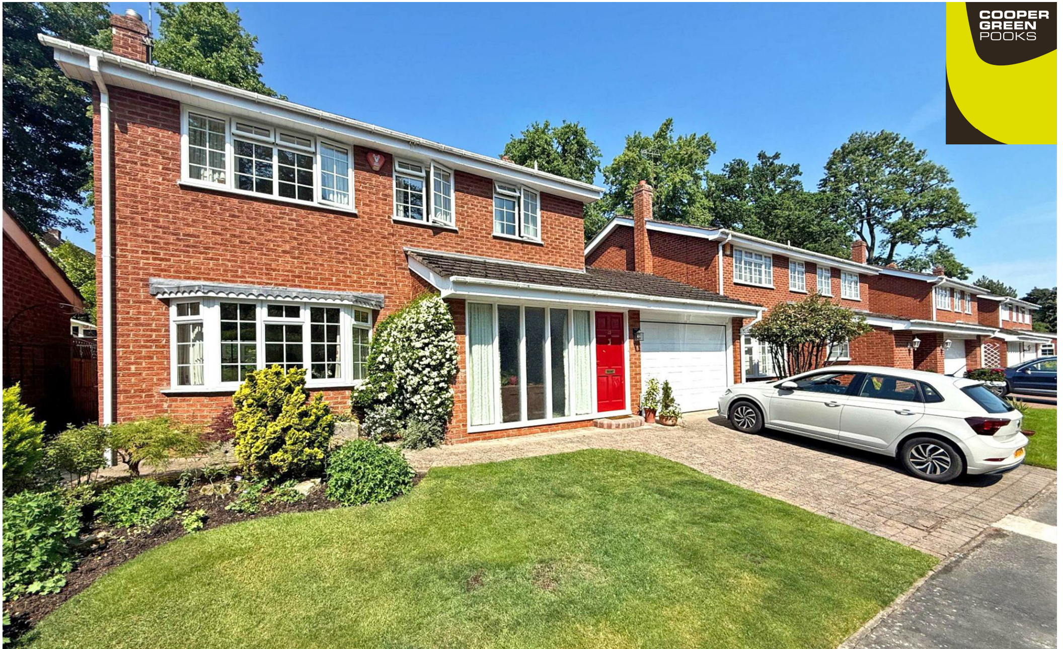
23, Ryelands, Radbrook, Shrewsbury, SY3 9BZ £495,000