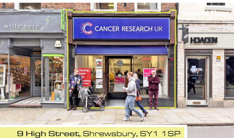
9 High Street, Shrewsbury, SY1 1SP