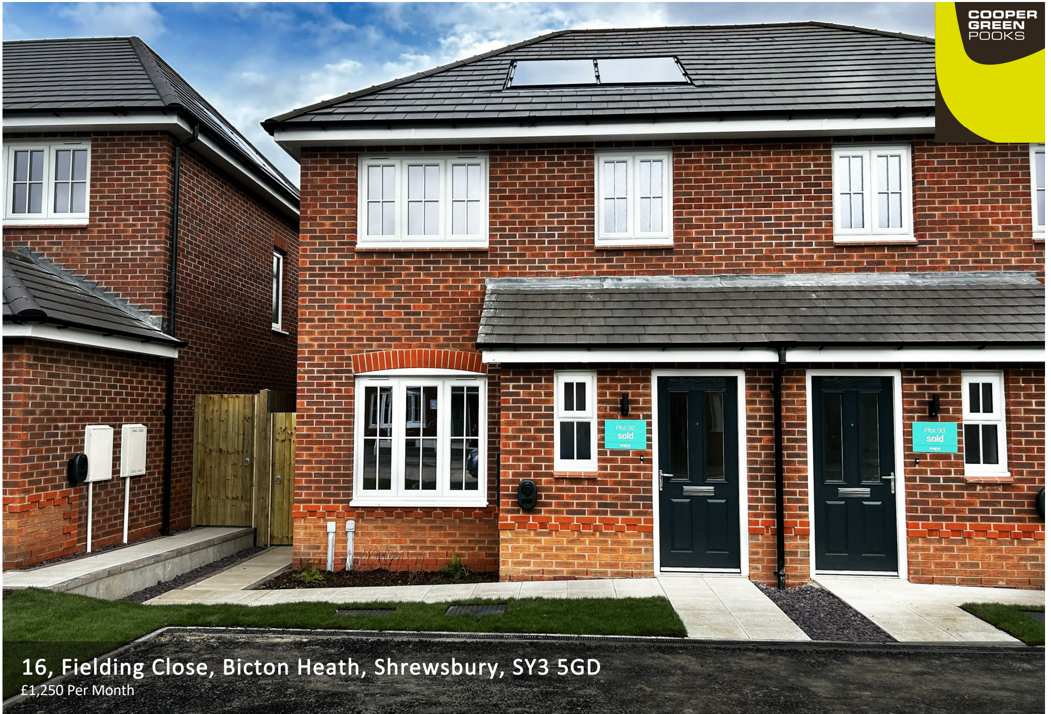
16, Fielding Close, Bicton Heath, Shrewsbury, SY3 5GD £1,250 Per Month