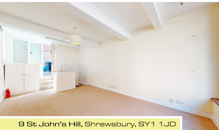
9 St John's Hill, Shrewsbury, SY1 1JD