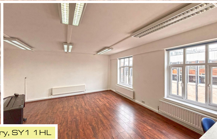
Second Floor Offices, 10b Shoplatch, Shrewsbury, SY1 1HL

For further information, contact: Cooper Green Pooks 01743 276 666 (Option 3)