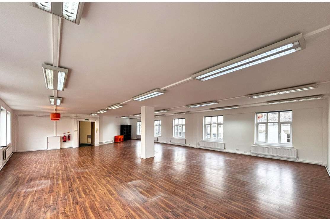
Second Floor Offices, 10b Shoplatch, Shrewsbury, SY1 1HL

The premises are to be let on a new lease of 6 years on a Tenant's apportioned full repairing and insuring basis with a Rent Review after 3 years.